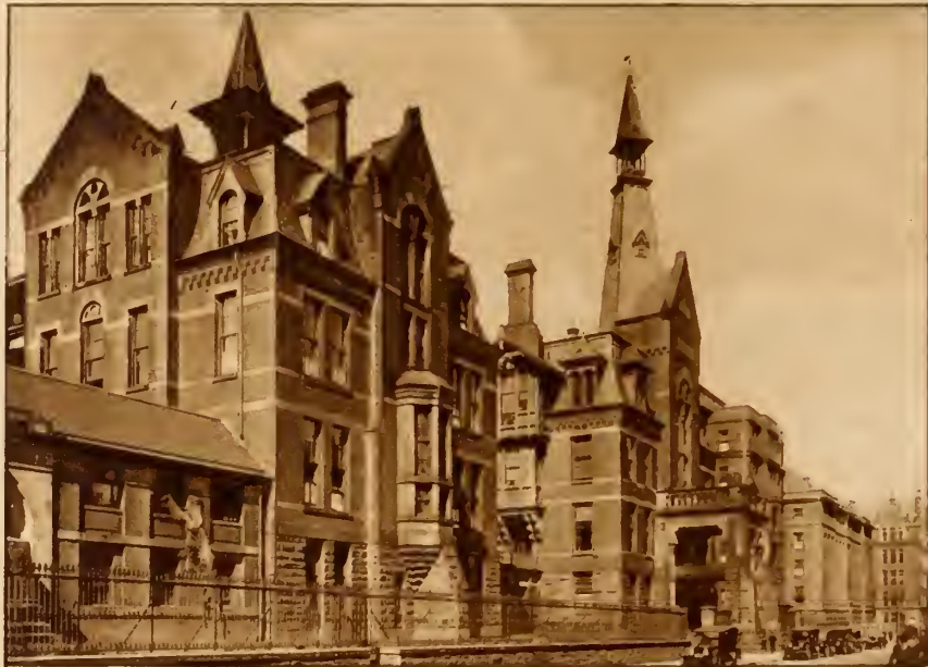
ROOSEVELT HOSPITAL, 9th Avenue and 59th Street.